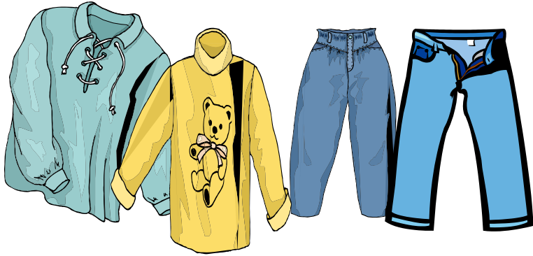
Two sets of top old clothing