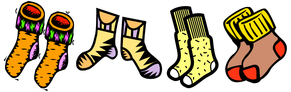
Four pairs of socks