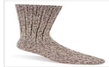
One pair of thick socks for wellington boots