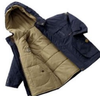
A warm coat or jacket