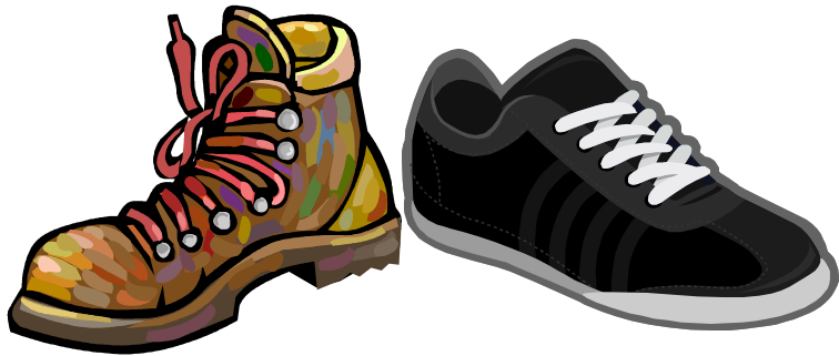
Boots or shoes for rough walking boots